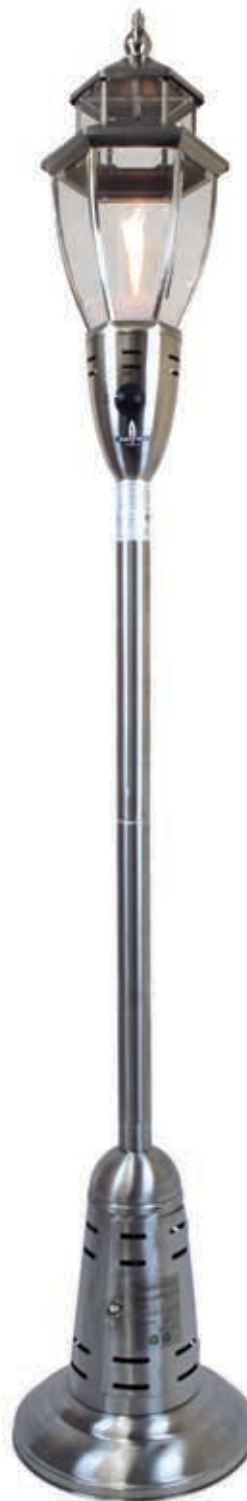
Shown: Stainless Steel