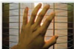
Safe to touch grill