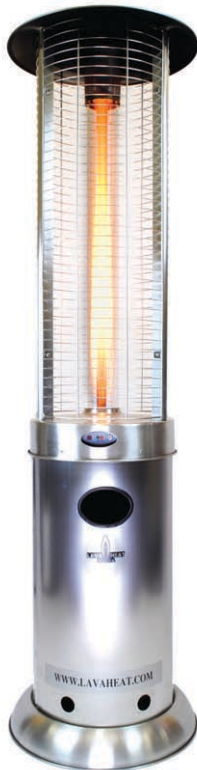
Shown: Stainless Steel